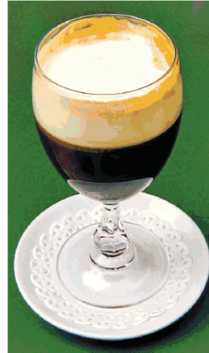
Caffè Al Bicerin, home of the bicerin, has been in operation since 1763.

Another passeggiata and you'll be ready for dessert. You won't be the only one lining up for gelato, even at this time of night. Gelateria il Siculo specialises in gelato and Sicilian-style granita (sorbet) and has some unusual flavours that you won't find anywhere else (violet, passionfruit, anise), along with the classics that are all made daily using fresh ingredients. The line can be long, but it moves fast. And there's plenty to look at in the small space while you wait. Via S. Quintino, 31